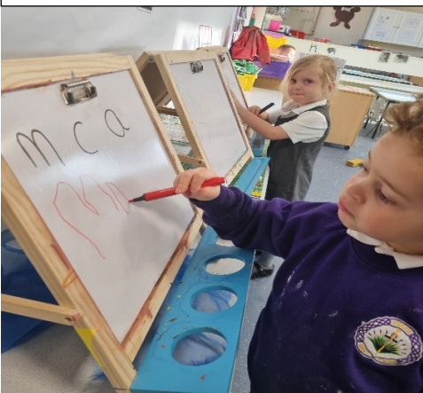
Ymarfer ein llythrennau Tric a Chlic. / Practicing our Tric a Chlic letter sounds.

We have had lots of fun this term learning about me and my world around me. We have looked at ourselves and learnt about parts of the body through playing and singing. By learning our colours we can see how colourful and beautiful the world is around us.