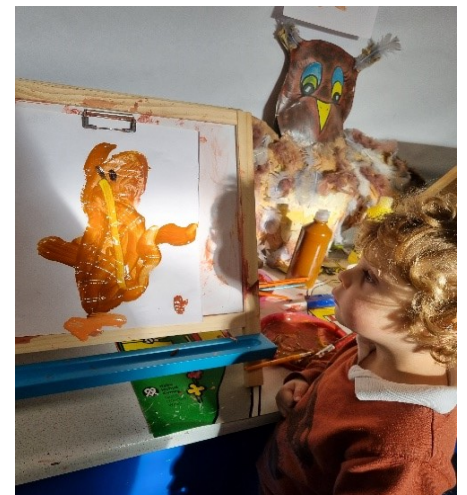
Llun arsylwadol. / Observational picture.