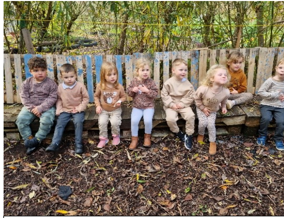
Yn yr Ardd Wyllt / In the Wild Garden . . .