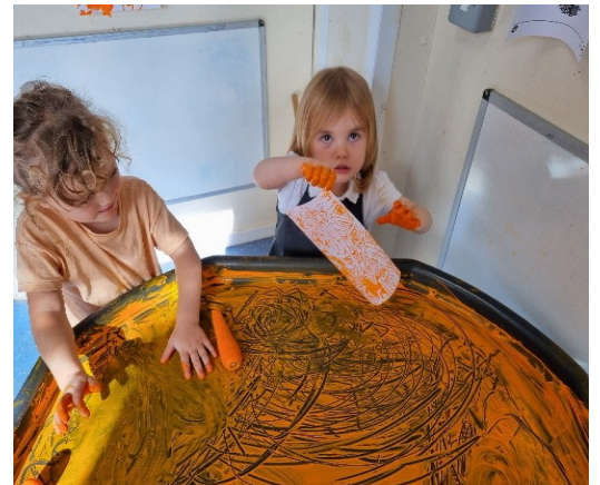
Ysgrifennu gyda moron a phrintio. / Writing with a carrot and printing.