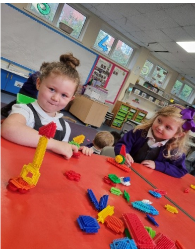
Pur ddychymyg. / Pure imagination.