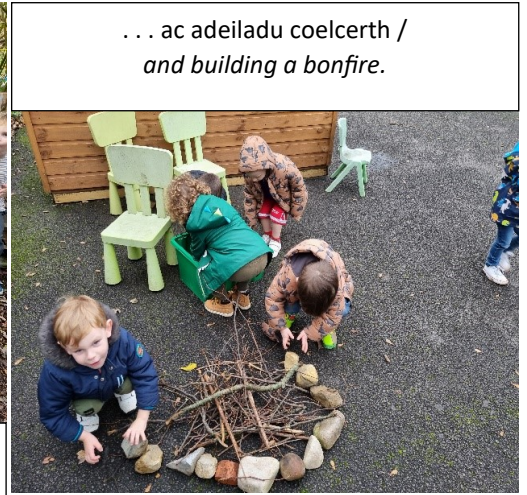
. . . ac adeiladu coelcerth / and building a bonfire.

Rydyn ni wedi cael llawer o hwyl a sbri yn dysgu amdanaf fi a fy myd o'm cwmpas. Rydyn wedi edrych arnaf i fy hun yn dysgu am rannau'r corff trwy chwarae a chanu. Trwy ddysgu am liwiau rydyn ni'n gallu gweld pa mor hyfryd a lliwgar y mae'r byd o'n cwmpas.