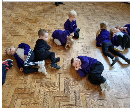
Addysg gorfforol – Draenog Bach yn Cysgu'n Drwm. / P.E.- The little hedgehog is sleeping heavily.