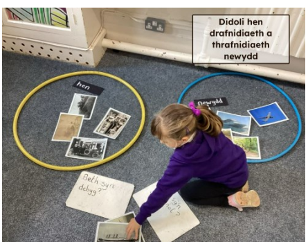
Didoli hen drafnidiaeth a thrafnidiaeth newydd