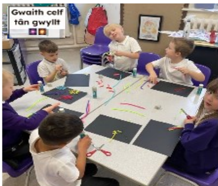
Gwaith celf tân gwylt

We are very grateful to you as parents and families for your support and we hope you have a very happy Christmas.