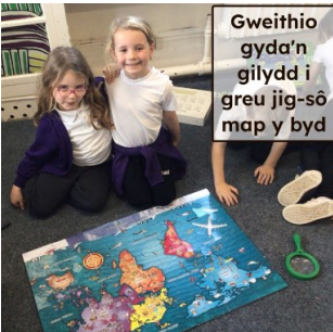
Gweithio gyda'n gilydd i greu jig-sô map y byd