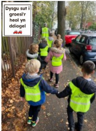
Dysgu sut i groesi'r heol yn ddiogel

Cawsom weithdy arbennig gan SparkLab. Roedd pawb wedi mwynhau creu arbrofion Gwyddoniaeth yn ymwneud â'n thema o deithio.